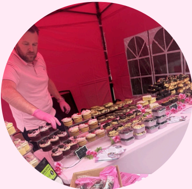
Markets and Events